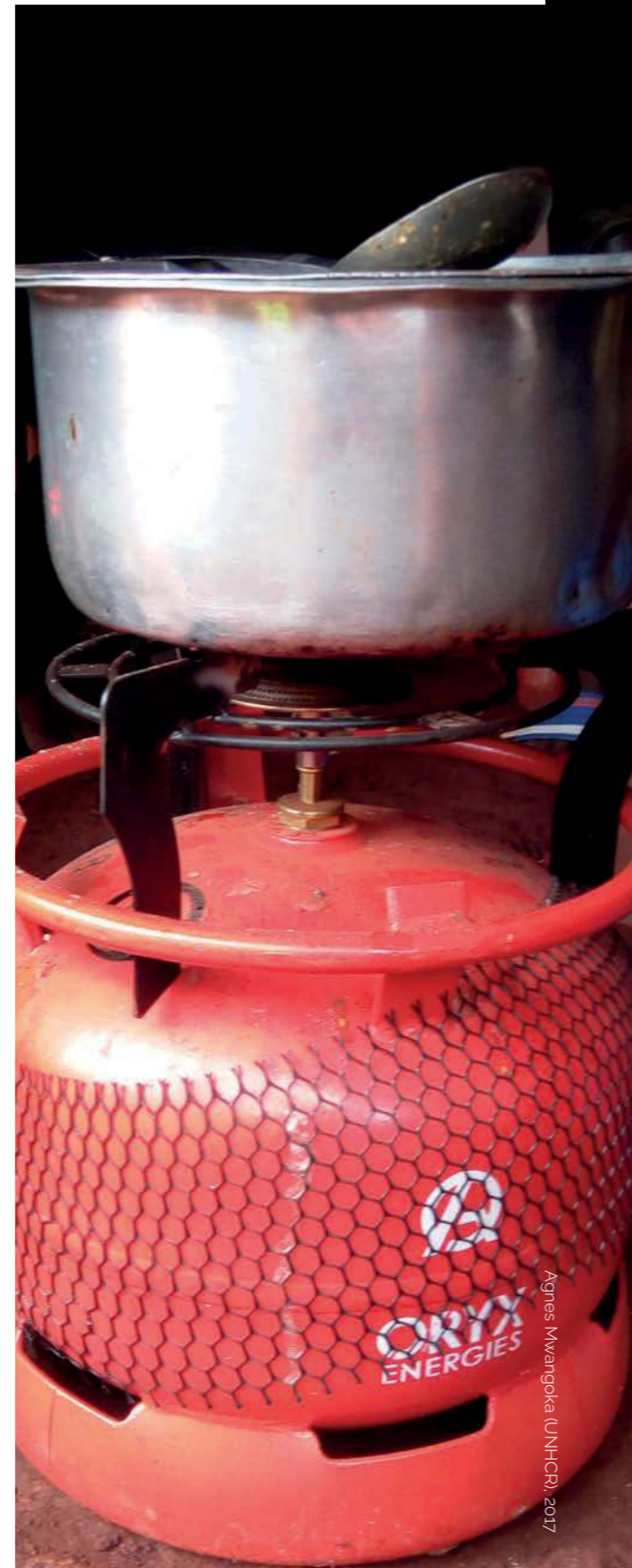
Agnes Mwangoka (UNHCR, 2017)